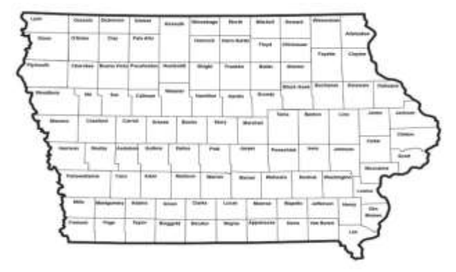
Fig. 3: Iowa's Counties

The purpose of data integration was to facilitate pavement performance modeling. The weather data were obtained from Iowa Environmental Mesonet (IEM) from 1998 to 2015. Ninety-nine weather stations have been selected to represent the environmental condition in Iowa. In case any counties have more than one weather station, the station that located near to the county center is selected. Figure 3 shows the counties map of the state of Iowa.